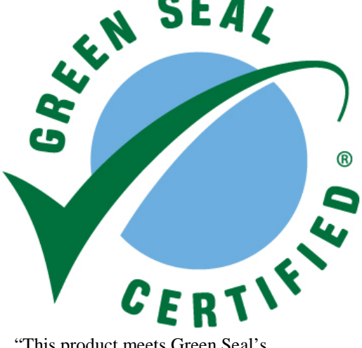
"This product meets Green Seal's environmental standard for industrial and institutional floor care products based on its reduced human and aquatic toxicity and reduced smog production potential"